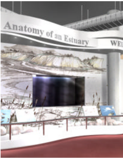
Architectural rendering of what the center section of the new Exhibit will look like.

The Estuary and Food Web sections will have murals in the same style and palette as the Entryway. Total exhibit wall length is about 40 feet.